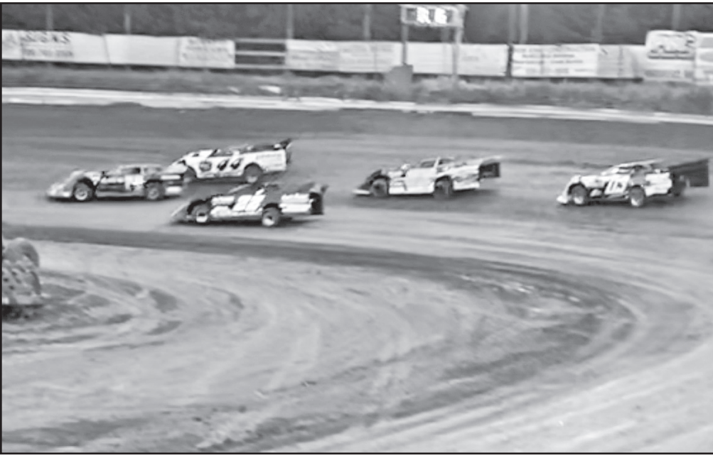
Action gets underway as the green flag drops in the Beginner 602 race.

Next Event: Friday, June 19th will feature a full racing program without fans, but all the action will be available for viewing at 7:30 p.m. on Facebook Live via the Tri-County Racetrack's page.