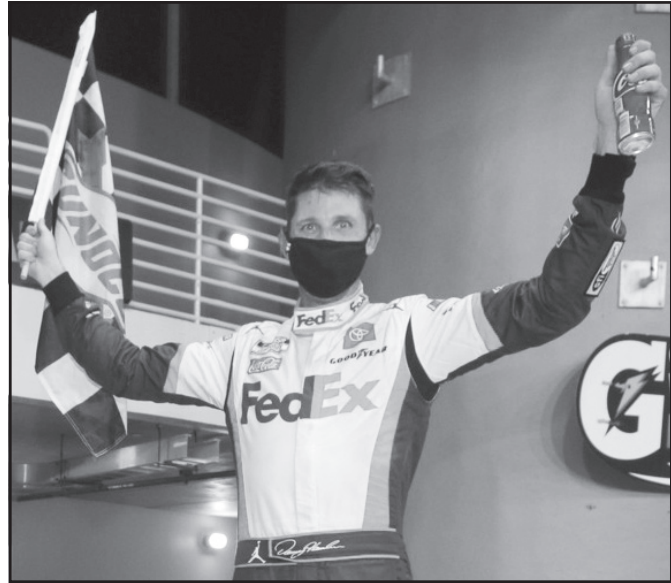
Hamlin Gets Third Win Of Season